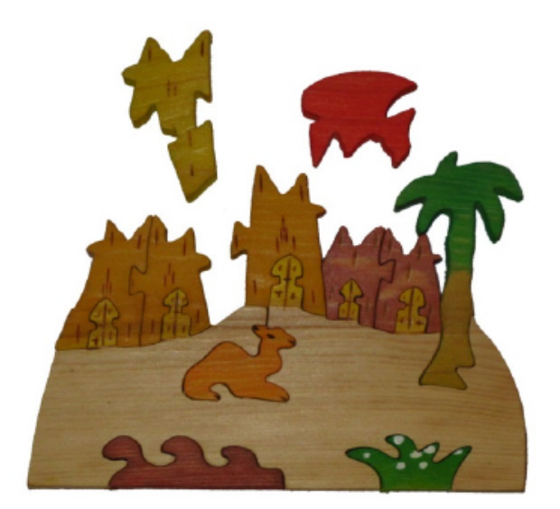
Figure H.1: The judge's wooden puzzle.

The judge has been wondering ever since last year whether it is possible to write a program to solve this puzzle. An important part of such a program is a method to evaluate how well two puzzle pieces "match" each other. The better the match, the more likely it is that those pieces are adjacent in the puzzle.