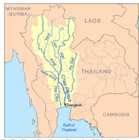
The Chao Phraya River System. Picture from Wikimedia Commons.

A simplified model of this river system is shown in Figure F.1, where the smaller red numbers indicate the lengths of various sections of each river. The point where two or more rivers meet as they flow downstream is called a confluence . Confluences are labeled with the larger black numbers. In this model, each river either ends at a confluence or flows into the sea, which is labeled with the special confluence number 0. When two or more rivers meet at a confluence (other than confluence 0), the resulting merged river takes the name of one of those rivers. For example, the Ping and the Wang meet at confluence 1 with the resulting merged river retaining the name Ping. With this naming, the Ping has length 658 km while the Wang is only 335 km. If instead the merged river had been named Wang, then the length of the Wang would be 688 km while the length of the Ping would be only 305 km.