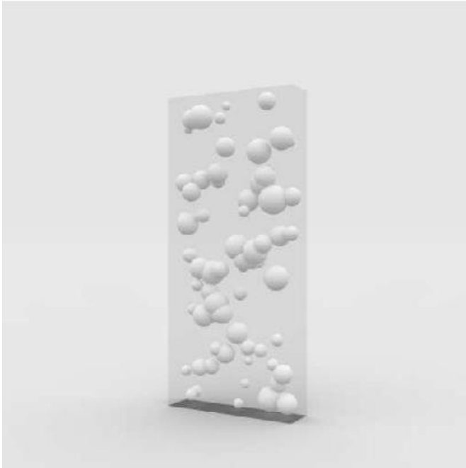
Figure 12: A strange object

In the year 2xxx, an expedition team landing on a planet found strange objects made by an ancient species living on that planet. They are transparent boxes containing opaque solid spheres (Figure 12). There are also many lithographs which seem to contain positions and radiuses of spheres.