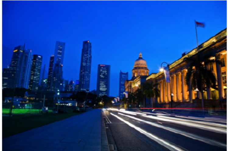
Saint Andrew's Road, part of the Formula One circuit (Kenny Pek, Piccom)

The authorities would like to deploy a new vehicle monitoring system in order to catch these illegal Saint Andrew's Road, part of the Formula One circuit racers. The system consists of a (Kenny Pek, Piccom) number of cameras mounted along various roads. For the system to be effective, there should be at least one camera along each of the possible circuits.