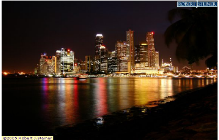
Skyline of Singapore at Night

The skyline formed by the first k buildings is the union of the rectangles of the first k buildings (see Figure 4). The overlap of a building, b_i , is defined as the total horizontal length of the parts of b_i , whose height is greater than or equal to the skyline behind it. This is equivalent to the total horizontal length of parts of the skyline behind b_i which has a height that is less than or equal to h_i , where h_i is the height of building b_i . You may assume that initially the skyline has height zero everywhere.