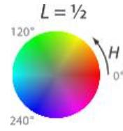
Figure 2: Cross section (at lightness = 0.5) (Those who are using a printed copy of the statement may not see the actual colour, but you will surely notice the change of grey shade)

Figure 1 demonstrates the HSL model. The angle around the central vertical axis is hue, the distance from the axis is saturation, and the distance along the axis corresponds to lightness.