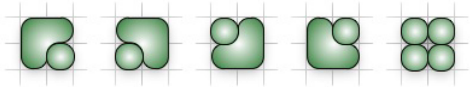
The five ways to pack a box of length 2.