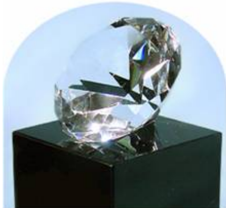
Figure 1: Diamond - A beautiful and precious crystal of Carbon

A scientist is trying hard to make a very large crystal, a large crystal of Carbon to be specific. He believes, as Diamond is a crystal of Carbon and very precious, so his new crystal of carbon would be as precious as Diamond in the long run. The atoms in his crystal will not hold together naturally, so he wants to put a strong force at the center of the crystal, which will attract all the carbon atoms and keep them together.