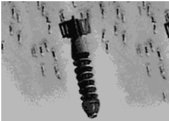
Bomb! No they are mines

Today is your big day. If you can beat the fastest robot in the IRQ2003 land, you'd be free. These robots are intelligent. However, they have not been able to overcome a major deficiency in their physical design — they can only move in 4 directions: F orward, B ackward, U pward and D ownward. And they take 1 unit time to travel 1 unit distance. As you have got only one chance, you're planning it thoroughly. The robots have left one of the fastest robot to guard you. You'd need to program another robot which would carry you through the rugged terrain. A crucial part of your plan requires you to find the how much time the guard robot would need to reach your destination. If you can beat him, you're through.