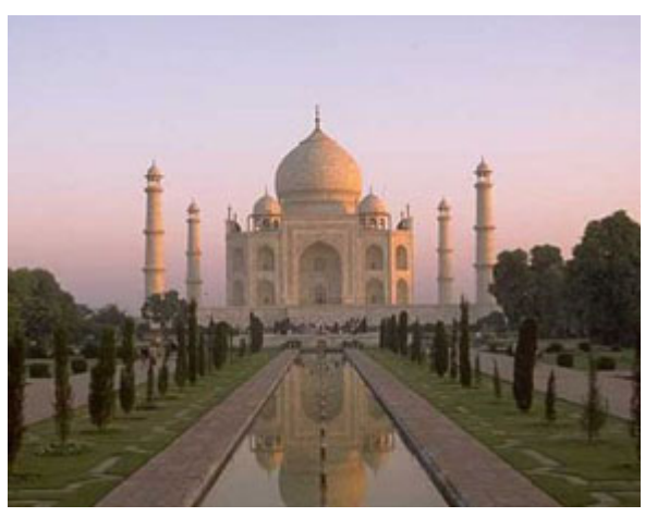
Figure 2: The Tajmahal of Shahjahan

If someone is interested to know more about Tajmahal (though not required for this problem) he or she can visit the following link: