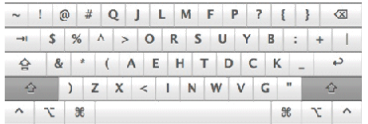
The right-handed Dvorak keyboard layout, shift-modified on right.

One day, as the coach was typing out a problem statement with his right hand, he discovered that he had forgotten to change the keyboard layout from QWERTY to Dvorak on the machine! Naturally, all the text came out scrambled, because he had struck the keys as if it were a right-handed Dvorak keyboard. Alas, it would take too much time to retype all the text with only one hand.